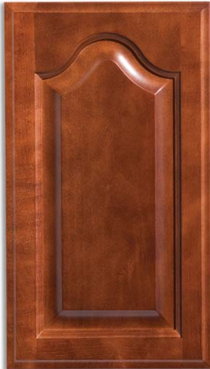
Shown: Spice Maple (SM)

*Due to limitations of color reproduction in photography and printing, colors may vary. Please visit an authorized Jenson Vanities dealer to see genuine color samples.